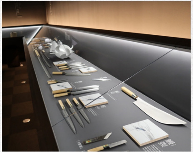
An exhibit showing various knives, each shaped differently depending on their use for fish, meat, vegetables and so on