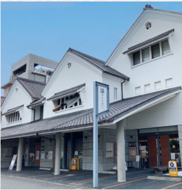
The Sakai City Traditional Crafts Museum in Sakai City, Osaka Prefecture