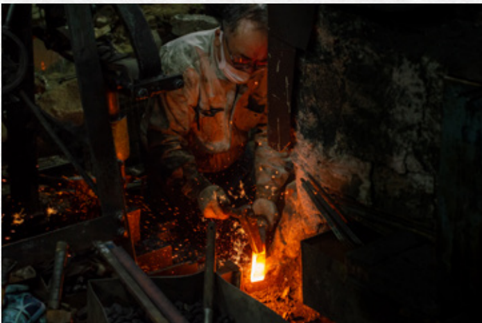
A bladesmith forging a knife