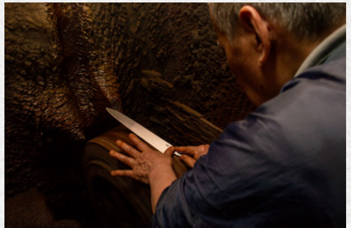
A bladesmith sharpening a knife