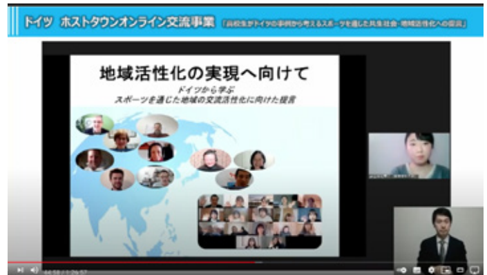
A scene from the presentation by high school students at the online Host Town Summit