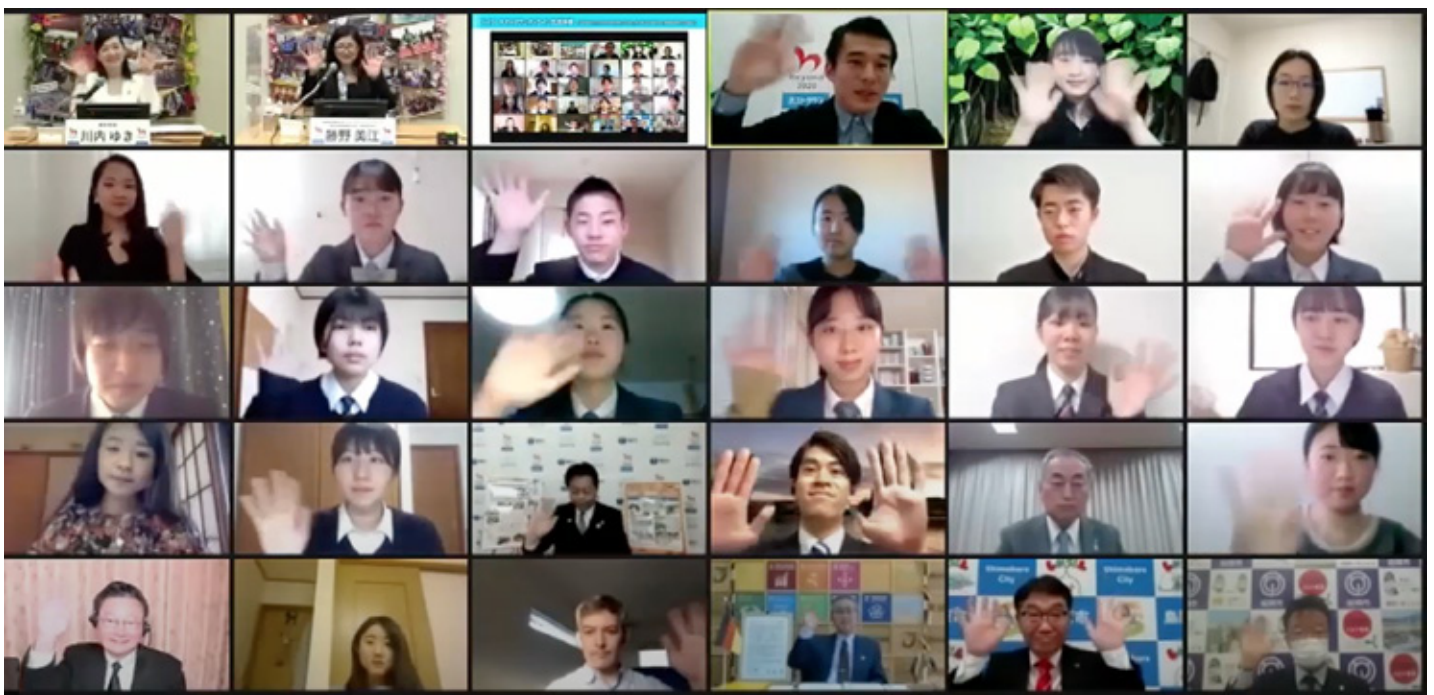
High school students and other participants at the Host Town Summit held online on February 21, 2021