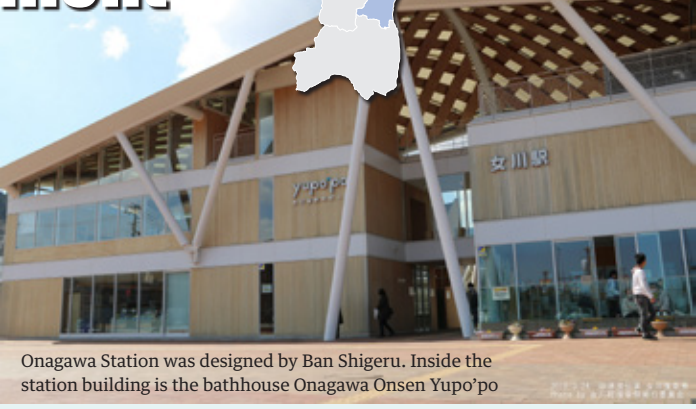
Onagawa Station was designed by Ban Shigeru. Inside the station building is the bathhouse Onagawa Onsen Yupo'po

Heavily damaged by the tsunami which followed the Great East Japan Earthquake of March 2011, Onagawa Town in Miyagi Prefecture has achieved safety and renewed vigor by rebuilding its urban district in a compact form.