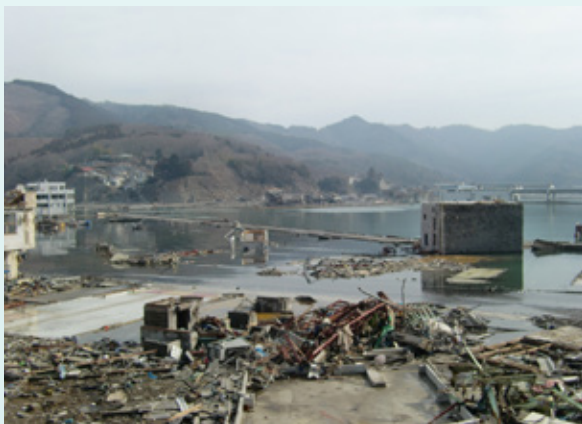
The central area of Onagawa Town immediately after the earthquake

In addition, in December 2015, Seapal-Pier Onagawa, a commercial facility based on the concept of “a town with a park from which people can enjoy seeing the sea,” opened along a brick promenade linking Onagawa Station and the port of Onagawa,