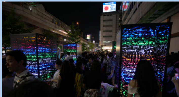
Scenes from past Roppongi Art Nights

Roppongi Art Night is an annual festival held in Tokyo's Roppongi district, which is known for its art. Throughout the night, the streets of Roppongi are embellished with a variety of artworks, including installations, music, video works and more.