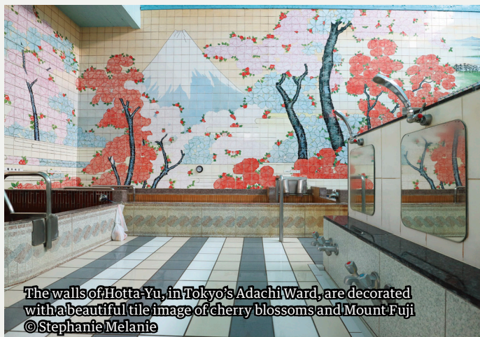
The walls of Hotta-Yu, in Tokyo's Adachi Ward, are decorated with a beautiful tile image of cherry blossoms and Mount Fuji.

“First, you remove your shoes,” she says. “Then you pay at the counter and go to the changing room. Remove your clothes and go to the bath area, but