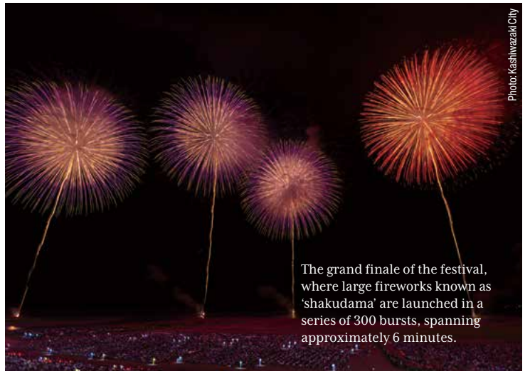
The grand finale of the festival, where large fireworks known as 'shakudama' are launched in a series of 300 bursts, spanning approximately 6 minutes.