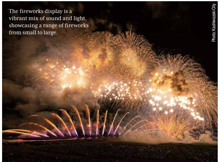
The fireworks display is a vibrant mix of sound and light, showcasing a range of fireworks from small to large.