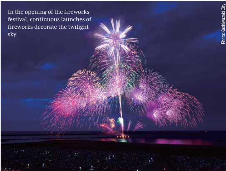
In the opening of the fireworks festival, continuous launches of fireworks decorate the twilight sky.