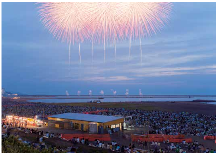
Large fireworks are launched against the backdrop of the Sea of Japan at twilight.

KOYAMA Yoko from the Kashiwazaki City Commercial Tourism Division shares her thoughts on the fireworks festival: "It's an impressive spectacle set against the sea, on a grand scale with breathtaking intensity. Particularly striking are moments such as the two consecutive rounds of 100 synchronized fireworks and the amazing launch of 300 large fireworks in rapid succession against the backdrop