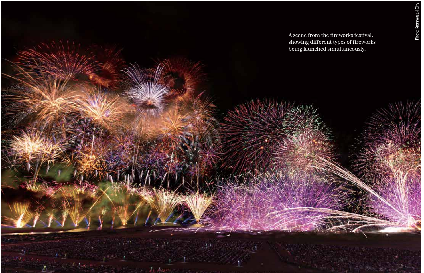
A scene from the fireworks festival, showing different types of fireworks being launched simultaneously.