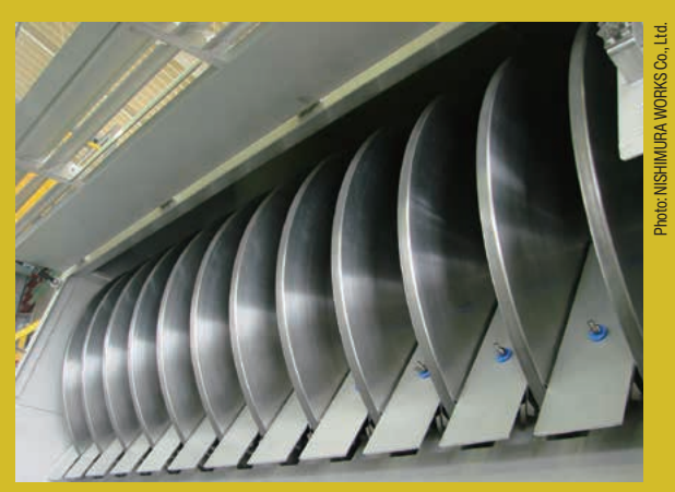
The CD Dryer model with 12 disks arranged inside the unit.