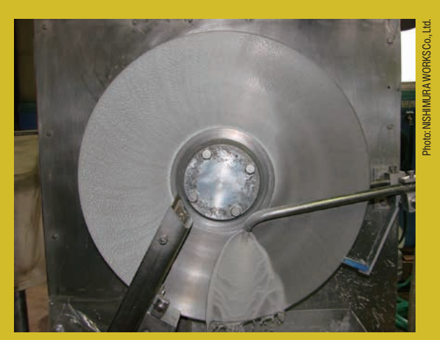
The process of pouring the target liquid onto the rotating disk.