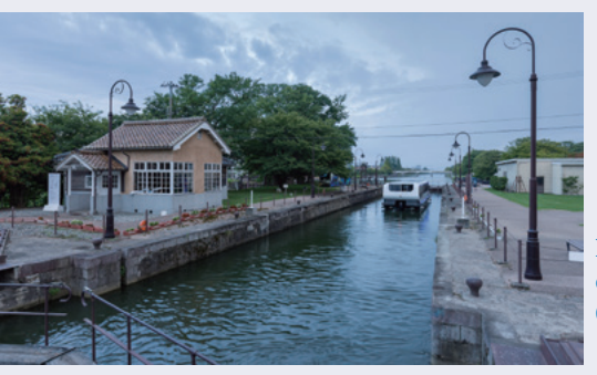
Nakajima Lock Area, one of the venues for Go for Kogei 2023

of crafts, contemporary art, and Art Brut.<sup>4</sup> Shokoji Temple (Takaoka City, Toyama Prefecture), Natadera Temple (Komatsu City, Ishikawa Prefecture), and Otaki Shrine and Okamoto Shrine (Echizen City, Fukui Prefecture) served as exhibition venues.