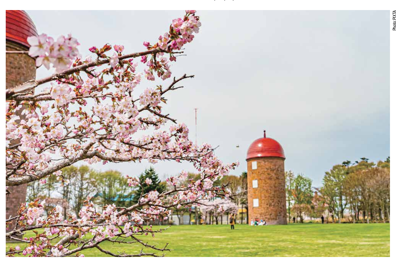
Chishima-zakura in Meiji Park