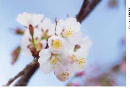
Chishima-zakura produces light pinkish-red flowers as its leaves

allowing for enjoyment of their changing colors. They are also characterized by their strong fragrance.