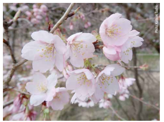
The Kumano-zakura (Kumano cherry) discovered by Katsuki Toshio

There are approximately fifty to sixty species of cherry worldwide, primarily distributed in the temperate regions of the northern hemisphere, particularly in the cool temperate zone<sup>1</sup>. Actually, North America has only two species, and Europe has only three to four species. Overwhelmingly, the majority