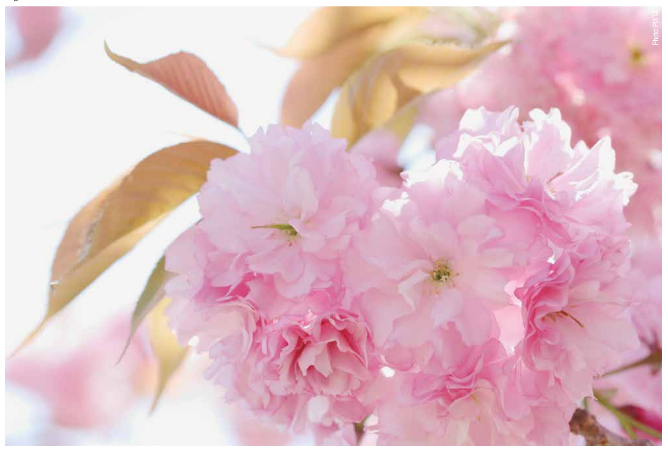
\hbox{`Sekiyama', a cultivated double-flowering cherry blossom variety.}