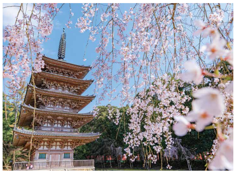
'Pendula' at present-day Daigo-ji Temple

blossoms in early spring, and wisteria in early summer. The tradition of cherry blossom viewing began to stand out distinctly, possibly around the late 19th century. The groundwork for this was laid around the 17th century. During the Edo period (early 17th century to mid-late 19th century), what we might now call mini-trips, where commoners in Edo (presentday Tokyo) ventured out together to famous cherry blossom viewing spots such as Ueno's Kaneiji Temple, Sumida River's embankment, and Asukayama