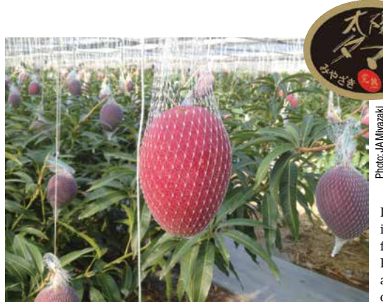
Left: The mangoes are placed inside nets until they ripen and fall off naturally. Right: The brand seal is only affixed to mangoes that meet certain standards.

ers in Okinawa, enabling shipments within three years. However, during that period, Miyazaki mangoes faced challenges with low recognition and inadequate quality assessment, resulting in slow sales. As farmers continued striving to stabilize mango quality, a significant discovery was made.