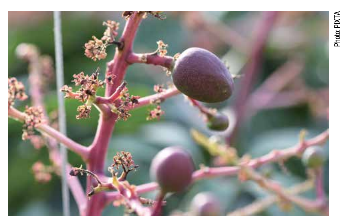
Beginning stage of mango fruit. Mangoes are rich in vitamin C, vitamin E, and folic acid, containing abundant nutrients beneficial for beauty and health maintenance.