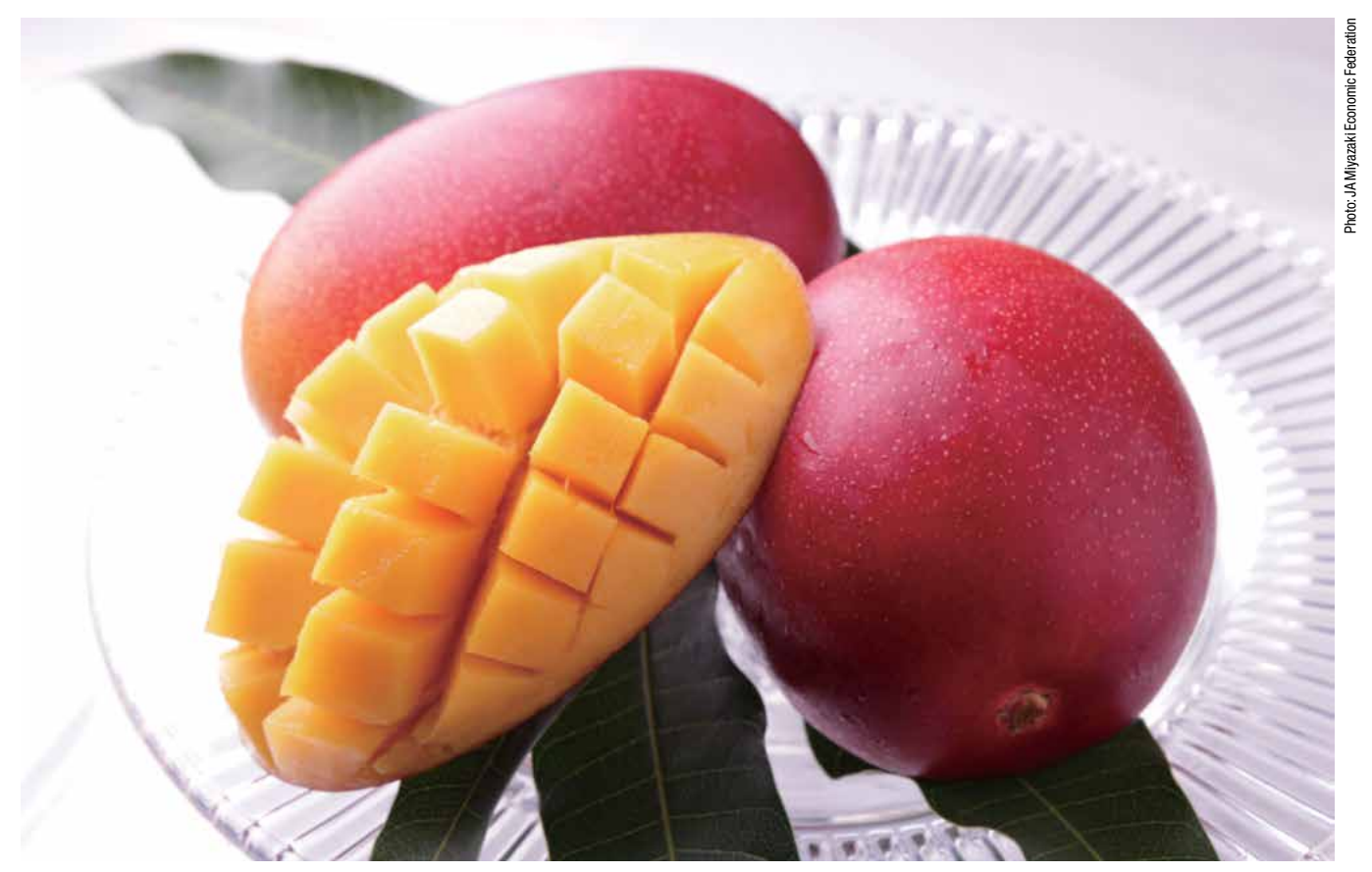
High-quality fully ripened mangoes from Miyazaki Prefecture

The cultivation expertise was acquired from farm-