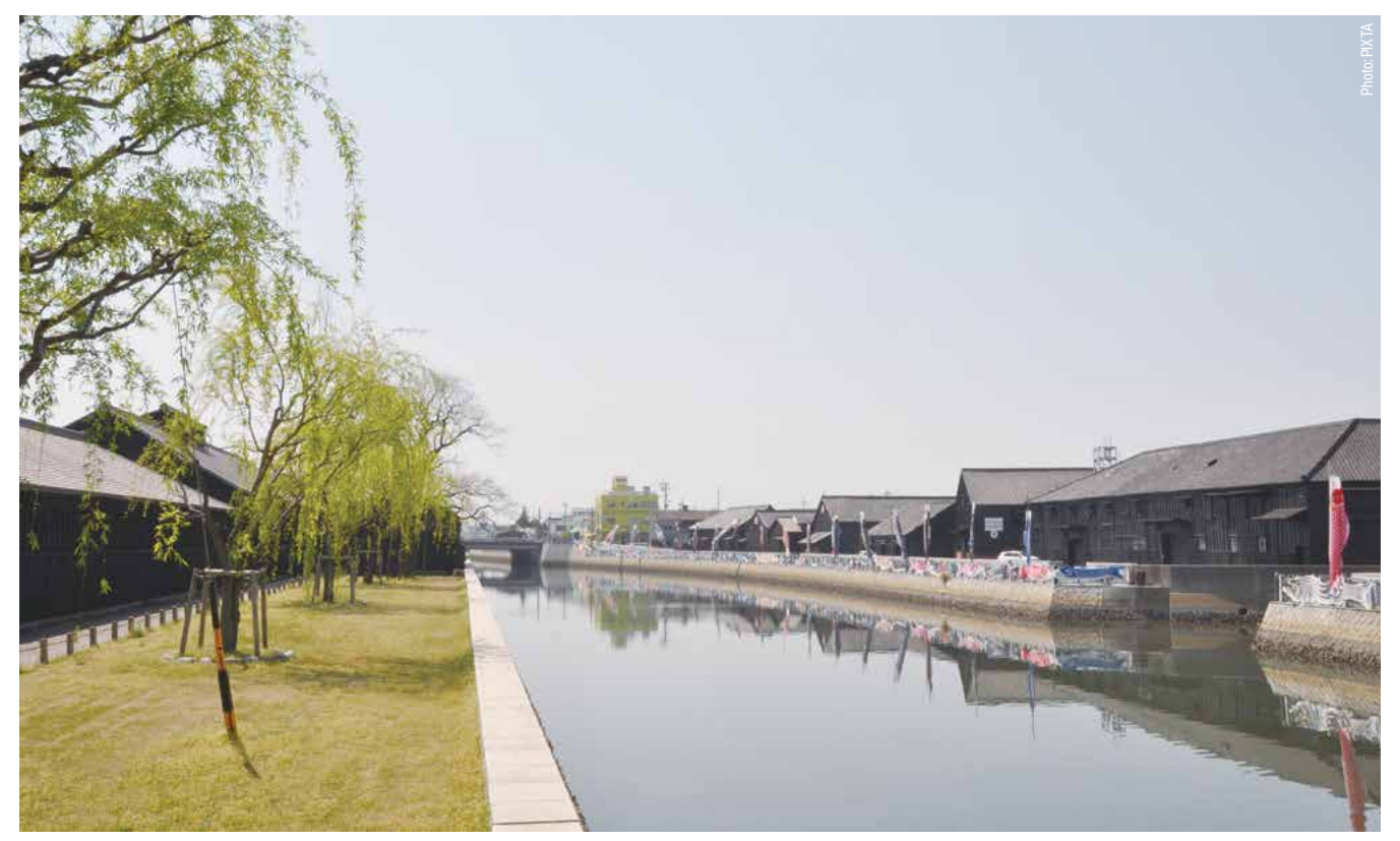
Scenery along a canal in Handa City, Aichi Prefecture. The canal is lined with black-walled warehouses.

The "One Village, One Product" project (see page 20), which originated in Oita Prefecture, has become a model for regional revitalization on an international scale, but how will Japan's local specialties develop in the future?