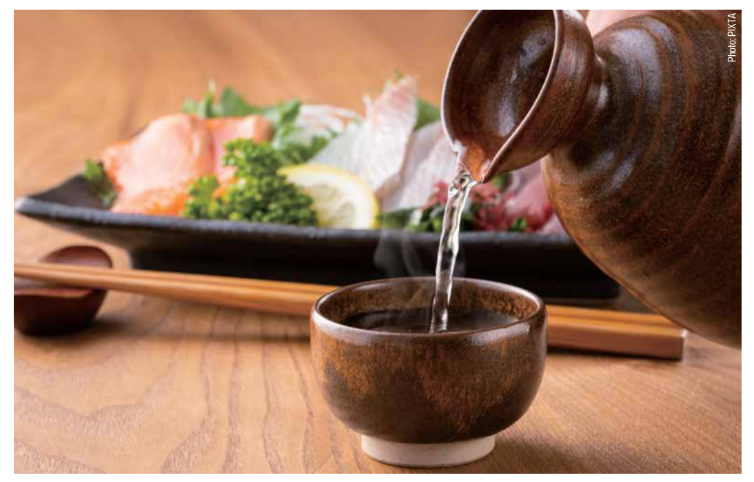
Japanese food and sake are two of the main attractions for tourists visiting Japan.

omy as long as they come up with distinctive specialty products and foods. This is the background to the vari-