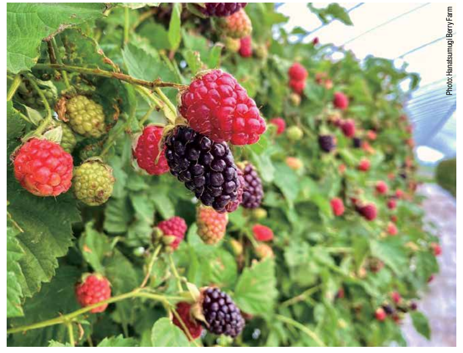
Adoberry fruits. Compared to other berries, the adoberry is quite large, and a single berry weighs about eight grams.

local specialties have helped revitalize a community. What is the story of their birth and development leading up to success with economic revitalization? Let me share the story of the adoberry, a type of berry grown in the former town of Adogawa in Takashima City, Shiga Prefecture. Its cultivation began in 2003, on the occasion of the opening of a new Michi-no-Eki (roadside station)<sup>3</sup> in the town, with the intention of creating a local specialty. The town succeeded in harvesting a New Zealand fruit called boysenberry,<sup>4</sup> which was rarely grown in Japan at the time, and named it adoberry from "Adogawa berry." The fruit is rich in anthocyanin and other functional antioxidants, which make it highly nutritious. Because the harvest