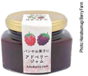
The adoberry has a short harvest season, but processed adoberry products can be sold for a long time.