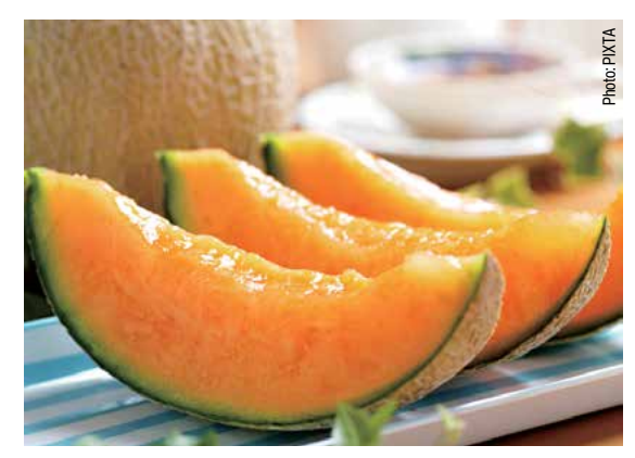
Yubari melons are known for their distinctive orange flesh, aroma and juiciness.

ous initiatives that have been undertaken over the years. One example is the Yubari melon, which was successfully created through selective breeding and cultivation in Yubari City, Hokkaido, in 1960. It was developed to revitalize a region that had prospered as a coal mining town, but declined after the closure of the mines. For over 60 years, the quality of the