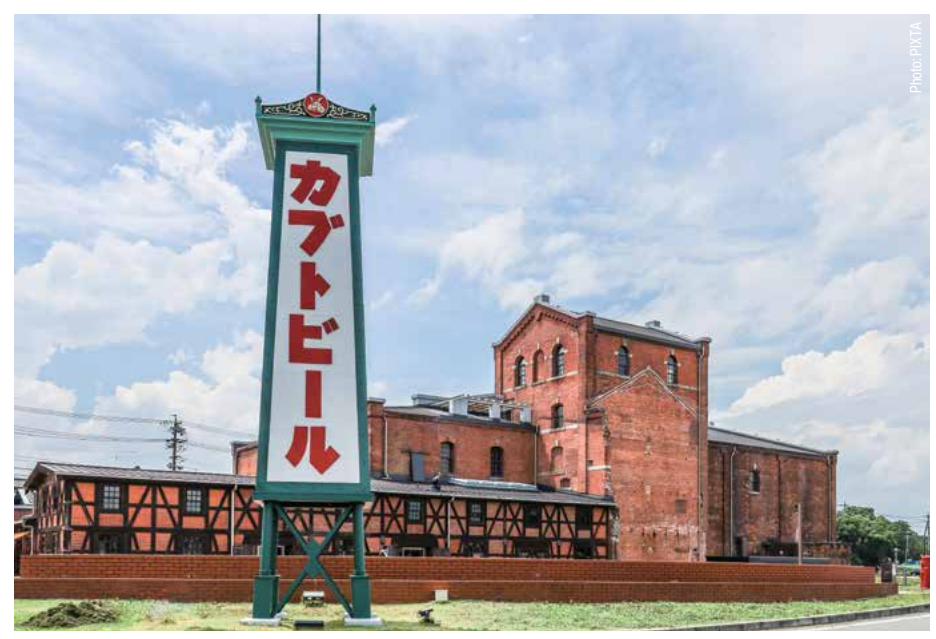
The Handa Red Brick Building built in 1898 in Handa City, Aichi Prefecture, as the brewery for Kabuto Beer.