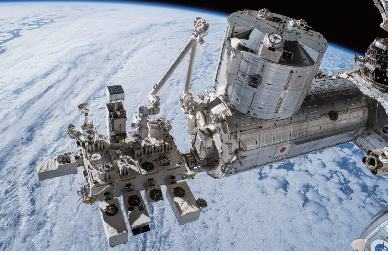
Overall view of the Japanese Experiment Module (JEM) Kibo, photographed during a spacewalk by US astronauts