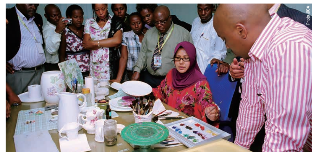
A JICA-supported training program for participants from Kenya, Nigeria, South Africa, Uganda, and Zambia being conducted at SIRIM Berhad, in Malaysia

Please share your thoughts on future prospects for international cooperation with ASEAN members, taking into account political and economic relationships between Japan and ASEAN.