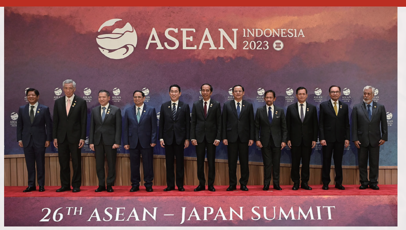
The 26th ASEAN-Japan Summit was held in Jakarta, the capital city of Indonesia (September 6, 2023)