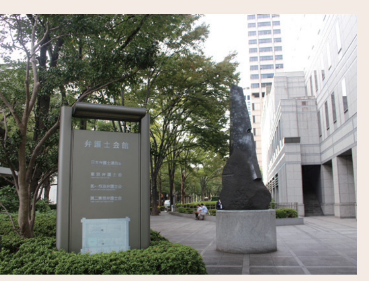
The entrance of the Bar Associations Building in Kasumigaseki, Tokyo