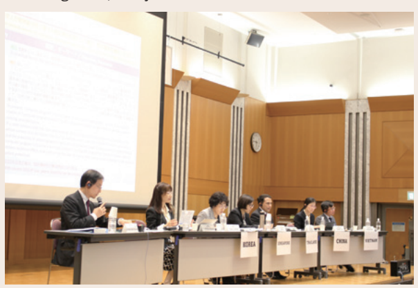
Inside the venue of the International Intellectual Property Judicial Symposium 2023