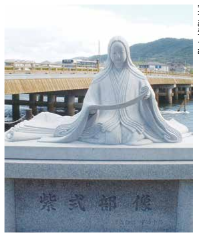
A statue of Murasaki Shikibu stands at the west end of Uji-bashi Bridge. The statue of the author was erected here in honor of the fact that the final ten chapters of Genji Monogatari are set in Uji.

Constructed around 1,380 years ago, Uji-bashi Bridge is recognized as one of the oldest bridges in Japan. At the foot of the bridge stands a tea house established over 860 years ago, whose owner, a hashimori bridge guard, continues to serve tea and watch over the bridge to this day.