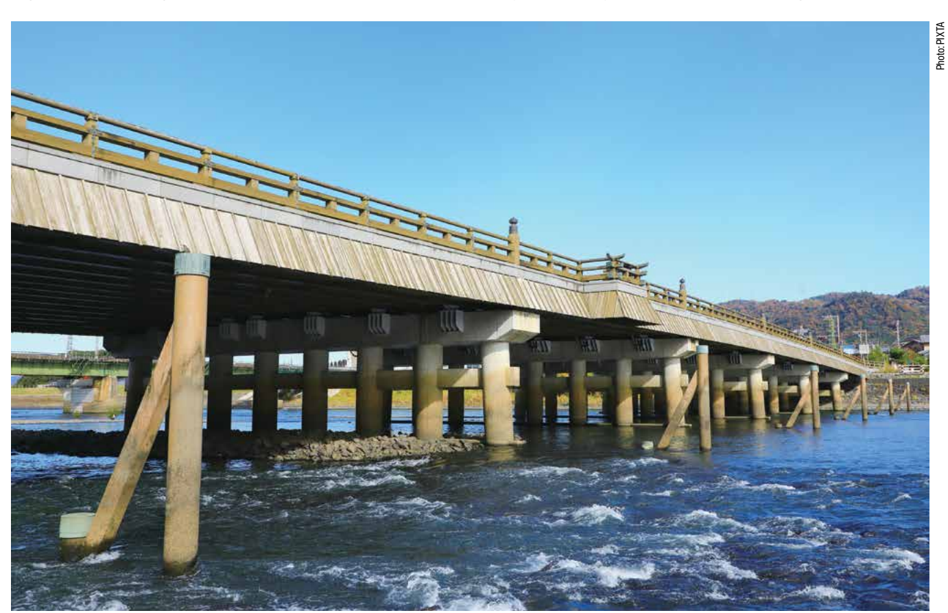
This Japanese-style sori-hashi arched bridge is 101.8 meters long and 8.4 meters wide.

Uji-bashi Bridge appears in the Kokin Wakashu ("Collection of Ancient and Modern Japanese Poetry")<sup>5</sup> and in Murasaki Shikibu's Genji Monogatari ("The Tale of Genji"),<sup>6</sup> both masterpieces of Japanese literary history. In fact, Uji is known as the setting for the last ten