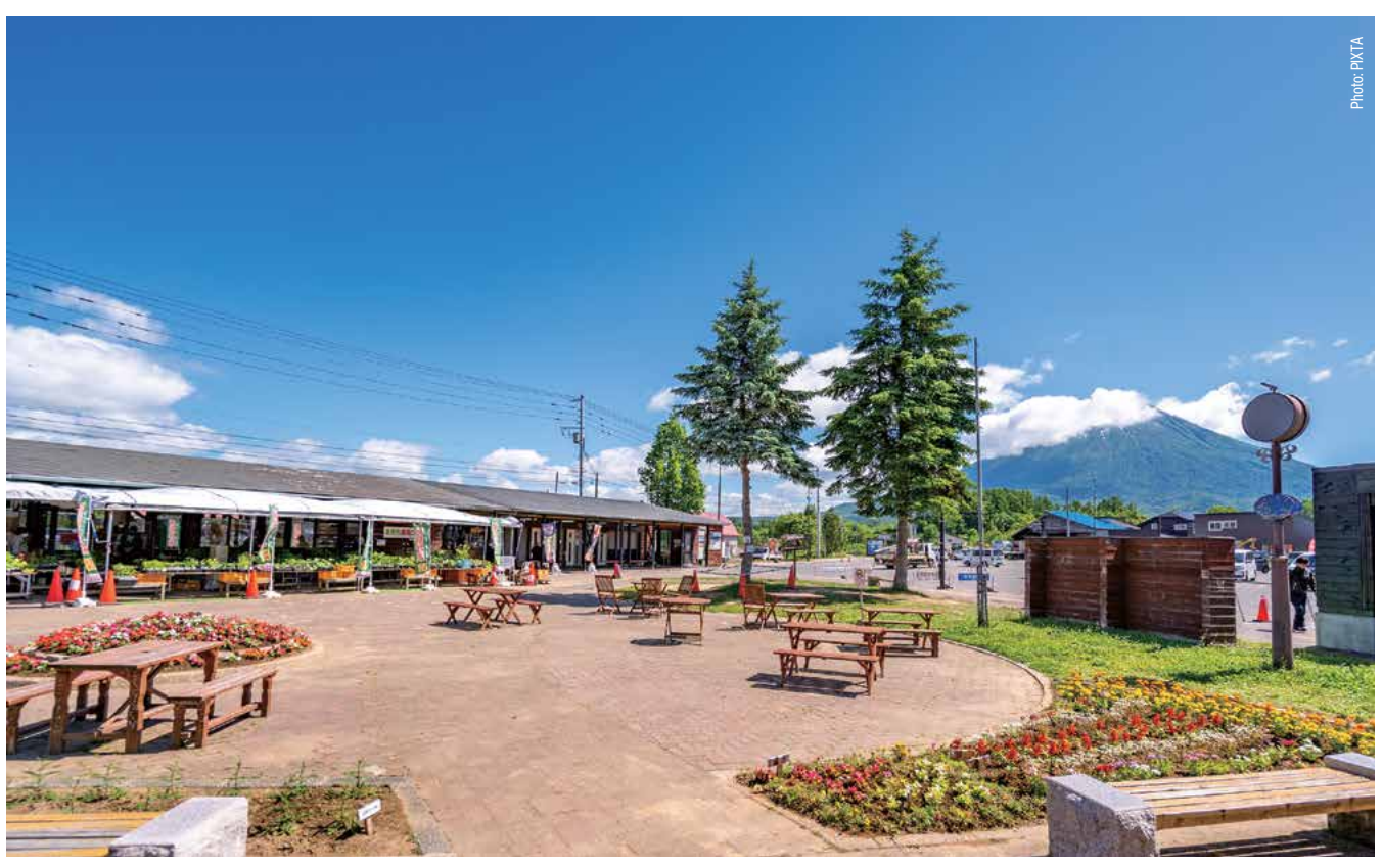
At the information center of Michi-no-Eki Niseko View Plaza in Hokkaido, staff from the local tourism association provide guidance on the town and nearby attractions. As a designated priority Michi-no-Eki to actively attract foreign tourists, it has implemented digital signage to provide regional information in English and provides WiFi access points that link to the Niseko tourism Facebook page, aiming to actively engage with English-speaking visitors.

In recent times, there has been an increase in the number of tourists visiting Michi-no-Eki , including both domestic and international visitors. Could you please share your outlook for the future?