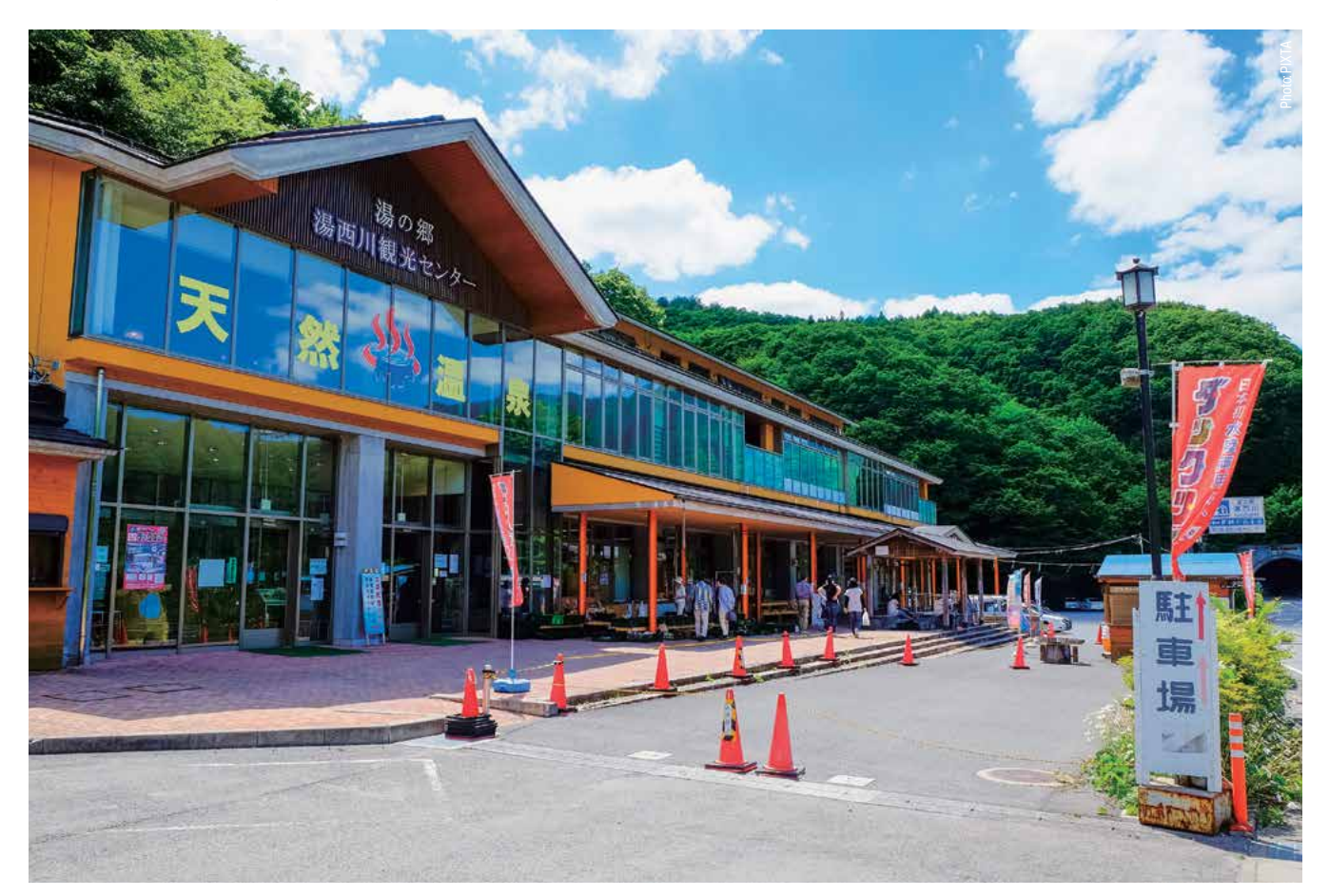
Michi-no-Eki Yunishigawa has a foreign tourist information center.

Moreover, in disaster-prone Japan, Michi-no-Eki are also greatly anticipated to fulfill a role in disaster prevention. During significant events such as the Niigata-Chuetsu Earthquake in 2004 and the Great East Japan Earthquake in 2011, Michi-no-Eki played a vital role as shelters, platforms for giving road and disaster information, and bases for comprehensive rescue and recovery efforts. In disaster-prone Japan, the development of communities that can respond appropriately to various disasters will continue to be a very important issue. In light of these national circumstances, Michi-no-Eki are also expected to serve as a hub for disaster prevention, recovery, and reconstruction, contributing to the resilience of communities in times of crisis.