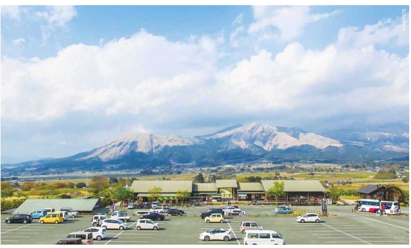
Michi-no-Eki Asobounosato Kugino was used as a base for relief efforts during the 2016 Kumamoto earthquake.