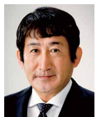
Niwa Katsuhiko Director-General, Road Bureau at the Ministry of Land, Infrastructure, Transport and Tourism

each region based on creative concepts. These include