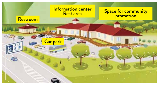
The car park, restroom, information center, and rest area will be developed by the road administrator or municipality

(Material provided by the Road Bureau, Ministry of Land, Infrastructure, Transport and Tourism)