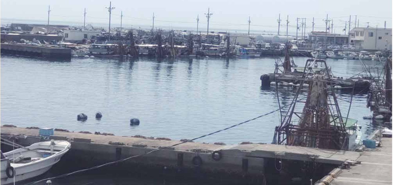
Akashi Port, where large numbers of Akashi sea bream are brought in

Another reason for the popularity of Akashi sea bream is its beautiful appearance. It is often described as the "Queen of the Seashore" because of the blue makeup-like pattern over its eyes, called eye shadow, and its light-pink body spattered with dots of blue.