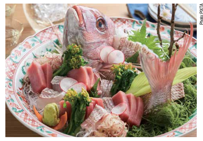
Sashimi prepared from fresh Akashi sea bream, arranged in its original shape

1. An approximately 4km-wide channel between Akashi City, Hyogo Prefecture, and Awaji Island