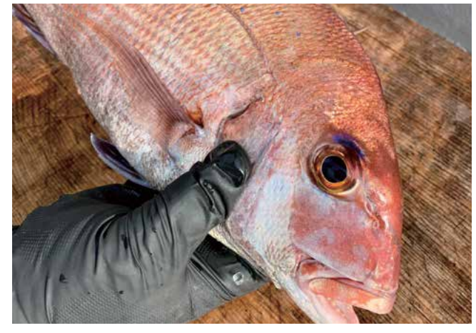
One of the characteristics of the Akashi sea bream is the vibrant blue pattern over its eyes